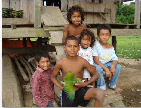
Clinica Evangelica Morava, Honduras