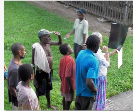
Kudjip Nazarene Hospital