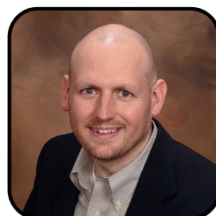
Israel Wayne Family Renewal