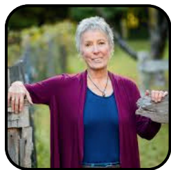
Sheila Carroll Living Books Curriculum