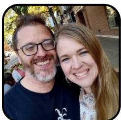
The Growing Roots Worship Leaders