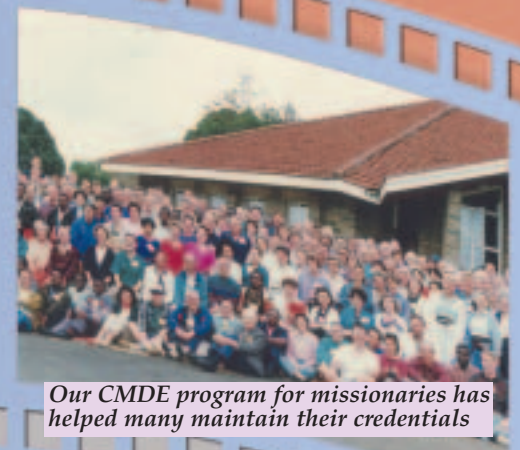
Our CMDE program for missionaries has helped many maintain their credentials