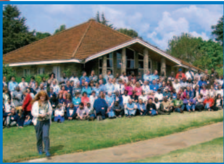
Kenya 2006 group photo—311 people from 35 nations