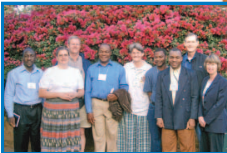
Morning small group prayer time bonds people closely during the conference, and offers prayer partners, worldwide

emerging, yet it remains our prime mission to provide excellence in accredited continuing education for our missionary members. All of us consider this our ministry to the missionaries and their families. We are always deeply blessed by the time we are able to spend with those precious people on the 'front lines.'"+