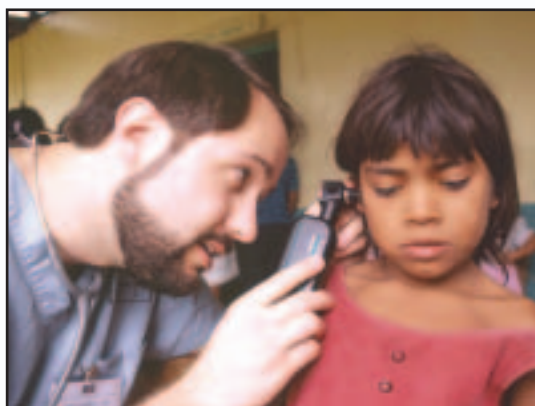
Not everyone is excited about receiving mission-field care, but our members are happy to provide it

By 2010, GHO plans to sponsor fifty trips annually, with 30