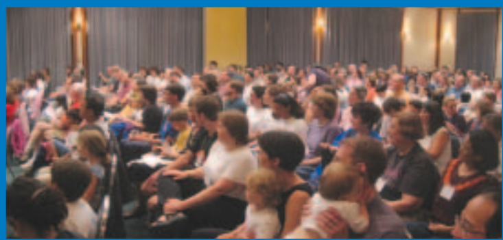
Worship time in Chiang Mai—500 plus singing and praying and enjoying being fed. Many cannot worship openly in their host country, so delight in such times as these