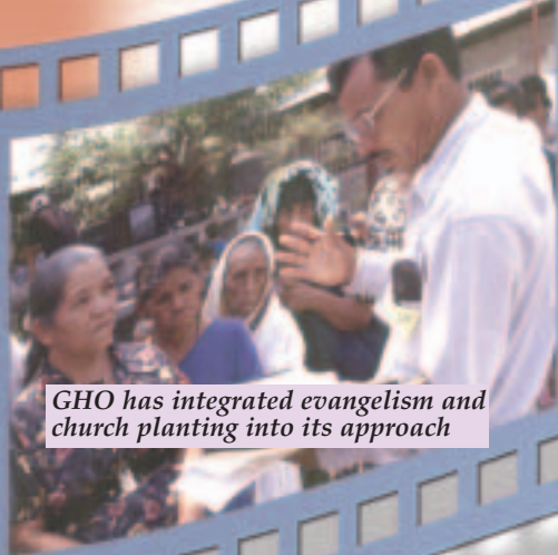
GHO has integrated evangelism and church planting into its approach