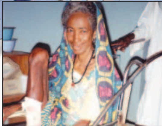
There's nothing like a colorful and heartfelt mission-field smile to reward a missionary doctor