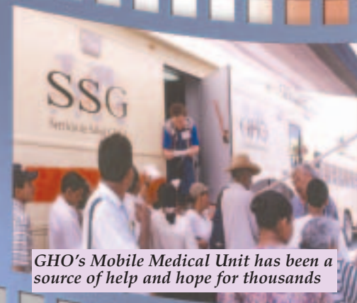
GHO's Mobile Medical Unit has been a source of help and hope for thousands