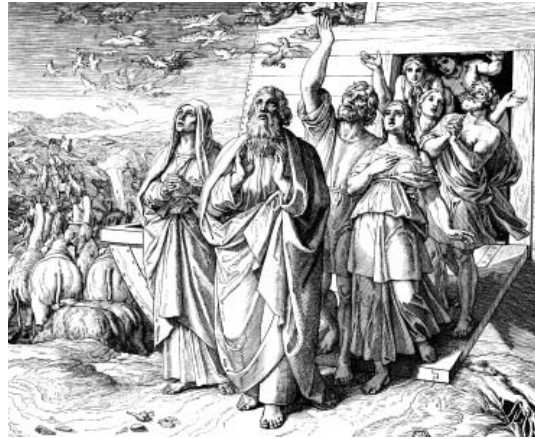
When God chose to destroy the wickedness and violence on the earth, he chose a righteous man, Noah, and his family to start over. He also chose one animal “family” from every species.

Households that come into a covenantal relationship with God through these types of decisions become partakers of God’s blessing to the families of the earth. They become part of the family of God through adoption by the Spirit, and part of Abraham’s descendants and his covenant. So what does this mean? It means that a believer’s family is actually part of Abraham’s family that